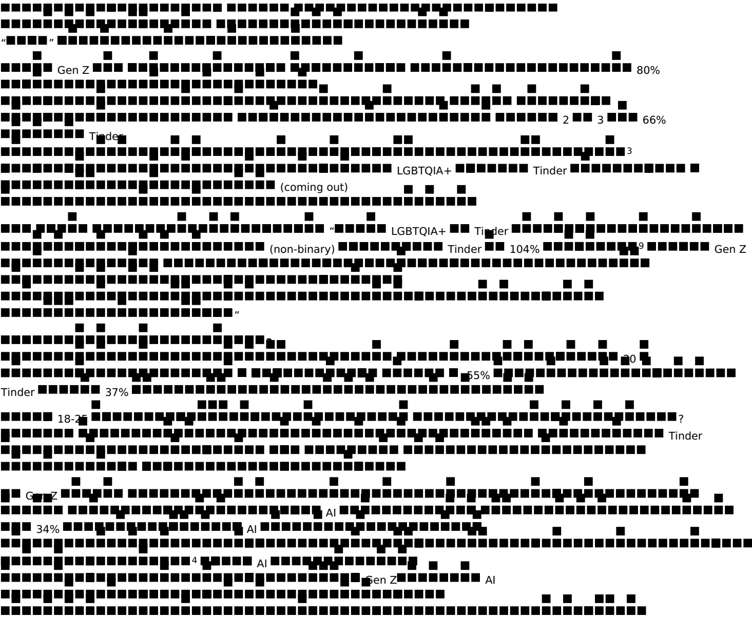
Future of Dating Report 2023